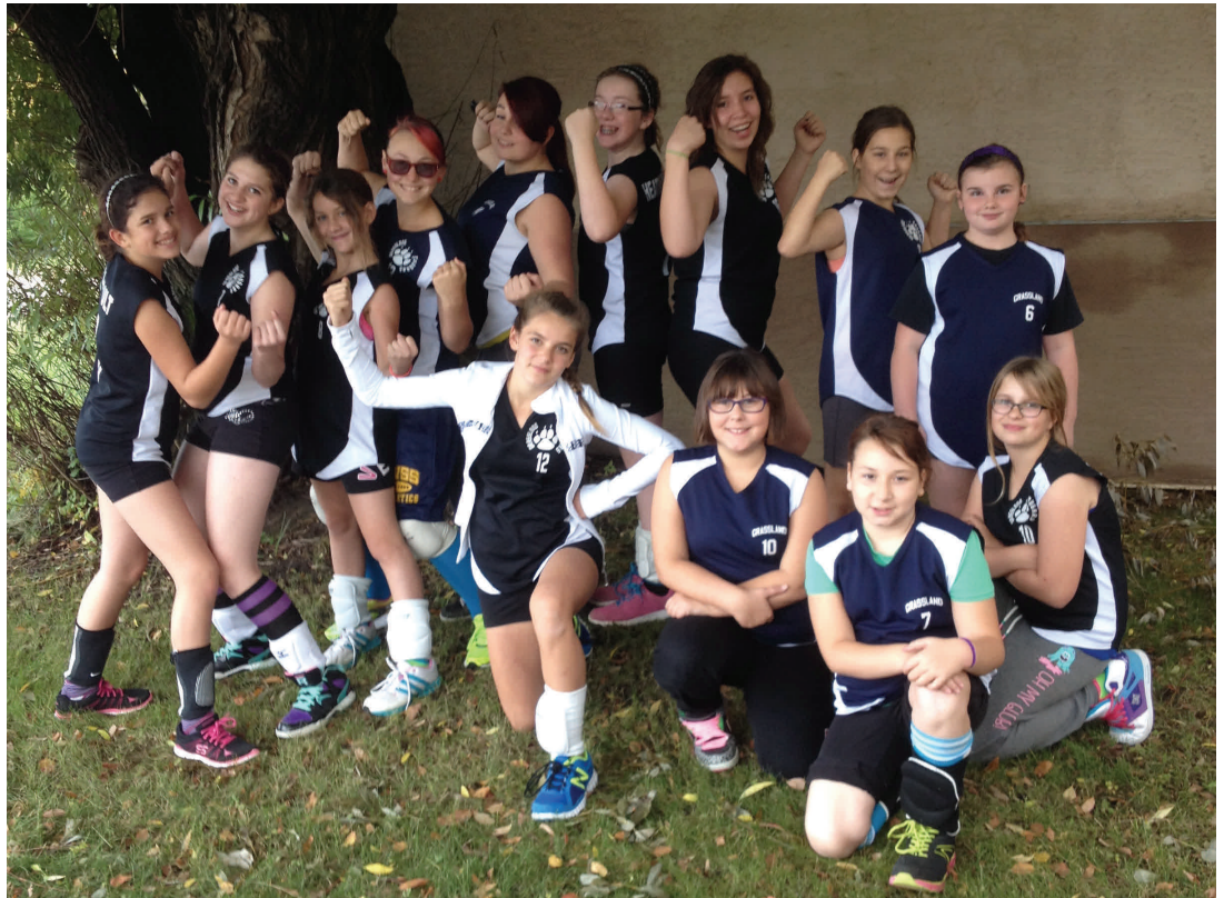
Junior High Girls at their home volleyball tournament at the beginning of November.